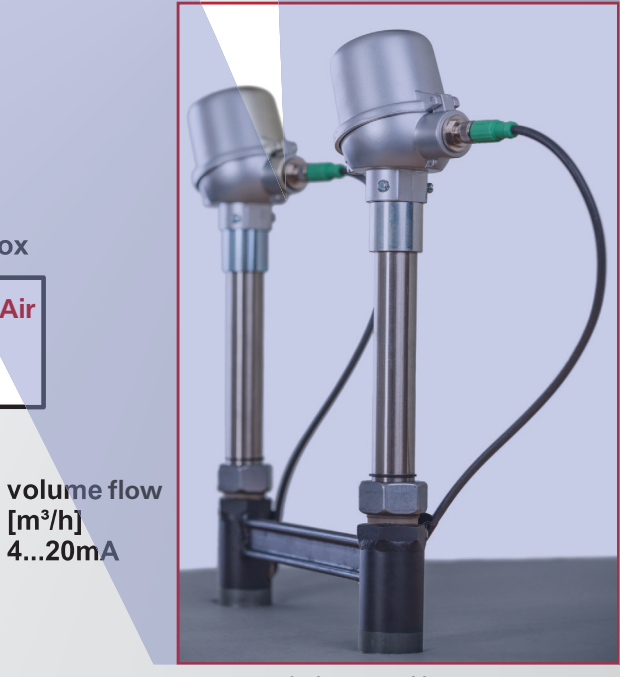
Sensors including metal bar connection

" Since we've had McON Air we don't have to worry about recalibrating.